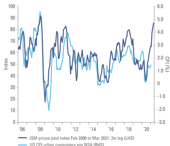
Fig 3: Prices paid vs CPI yoy

Despite the near-term inflationary risks and the large fiscal stimulus now underway, the Chairman of the Federal Reserve Jerome Powell said that monetary policy would remain loose. When asked about the sharp increase in term yields in the US Treasury market, Powell said that he “would be concerned by disorderly conditions in markets or persistent tightening in financial conditions”. Financial conditions remain very loose as long-term mortgage rates are still close to their lowest levels in history. Investment grade bond spreads also remain tight and equity markets are still trading close to their all-time highs.