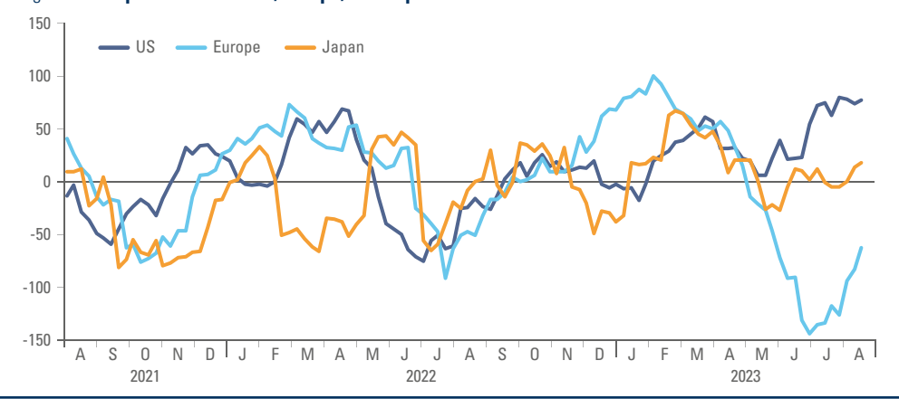
Fig 1: Citi Surprise Index for US, Europe, and Japan

Data as at 18 August 2023.