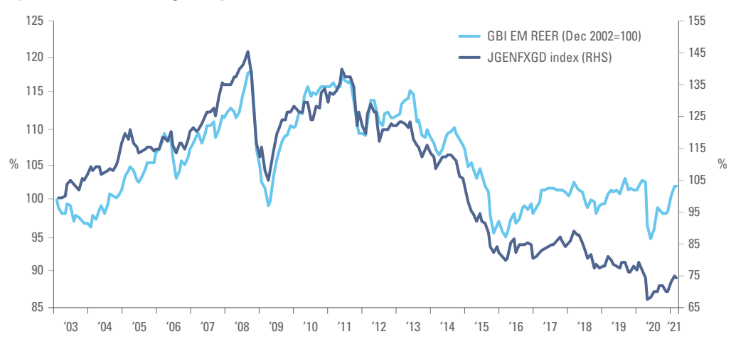
Fig 3: EM currencies (weighted by GBI-EM GD) in nominal and real terms

Source: Bloomberg, JP Morgan, Ashmore. Data as at 19 February 2020.