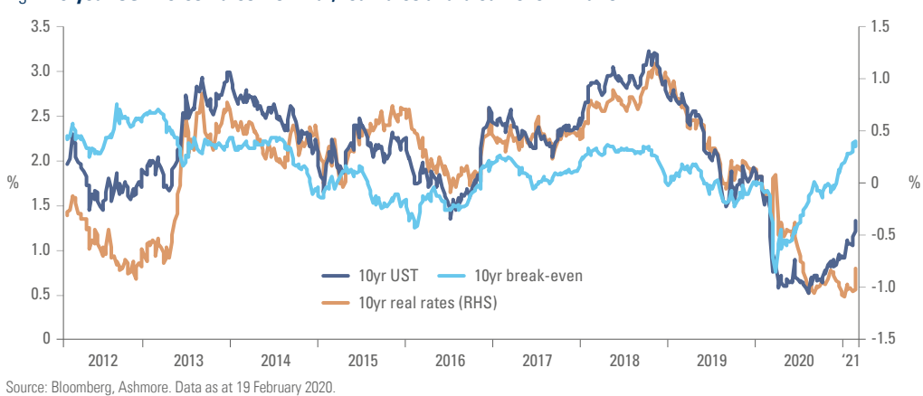
Fig 1: 10-year US interest rates: nominal, real rates and break-even inflation

The interest rates on US treasury bonds have been on the rise since the end of July last year. Most of the increase in nominal yields can be attributed to a repricing of future inflation expectations. Figure 1 shows the yield on the 10-year US Treasury bond, which has increased from an all-time low of 0.53% on 31 July 2020 to 1.34% as of last Friday (+81bps). Over the same period, break-even inflation as priced by the 10-year inflation-linked US Treasury bond increased by 60bps from 1.55% to 2.16%, while real interest rates rose from -1.03% to -0.82%. The main difference in last week's price action is that real yields rose 20bps, leading to fears over a sharp further move higher, since real rates are still very low (close to the previous lows in December 2012 of -0.91%).