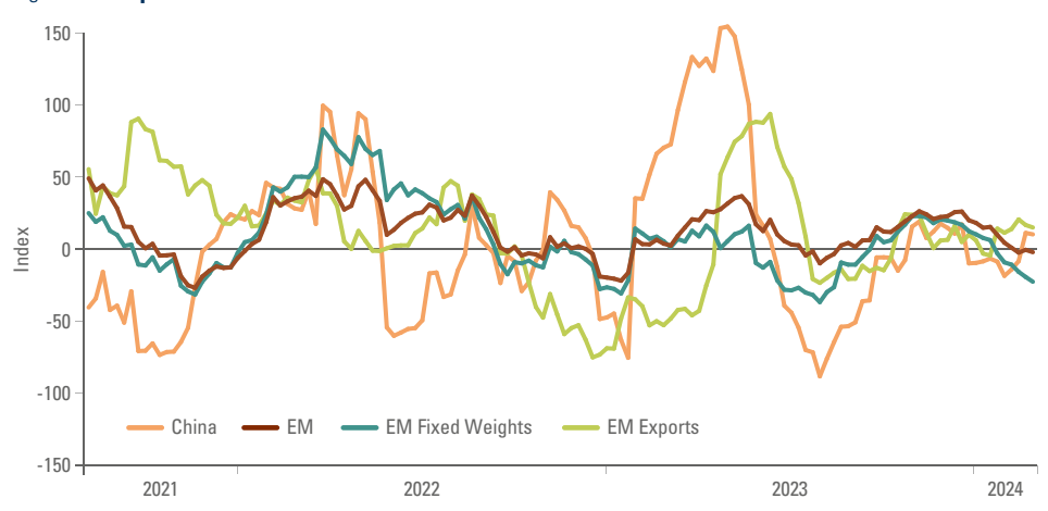
Fig 2: Citi Surprise Index – EM

Data as at 16 February 2024