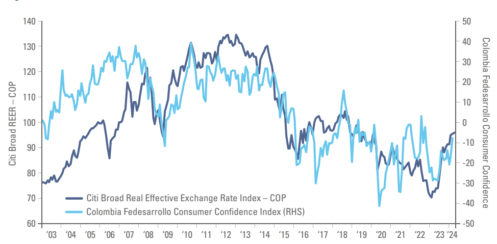
Fig 3: COP Broad REER (Citibank) vs. Consumer Confidence

Colombia: Consumer confidence improved by 10 points to -7.9 in January, a step increase from the lows of -28.8 in April 2023. Consumer confidence has not been above zero for more than four months since 2015. Most of the negative sentiment may be attributed to the decline in purchasing power from a lower peso as per Fig 3. Retail sales declined 4.7% in December, from -3.4% in November, below consensus at -2.3%.