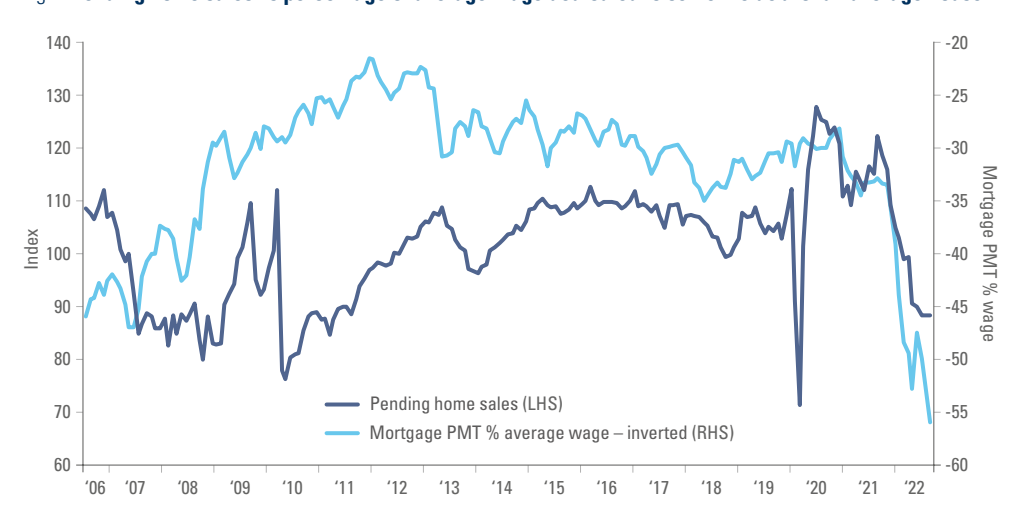
Fig 2: Pending home sales vs percentage of average wage dedicated to serve the debt of an average house

Data as at 30 September 2022