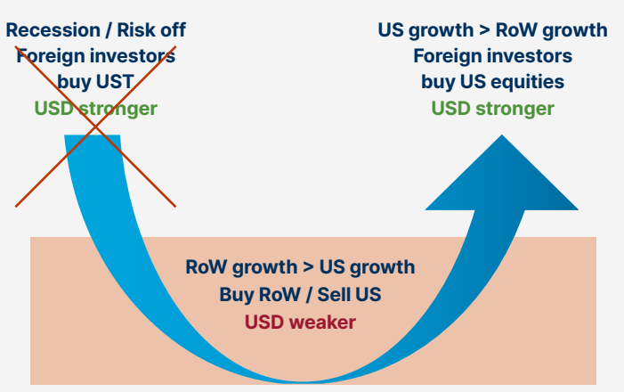
Fig 3: Dollar Smile no more