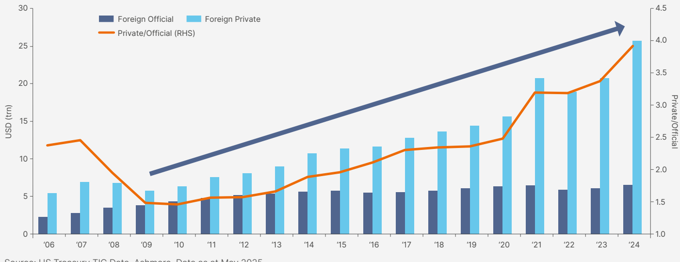
Fig 1: Foreign Portfolio Investment in US: Private vs. Official (USD trn)

Source: US Treasury TIC Data, Ashmore. Data as at May 2025.