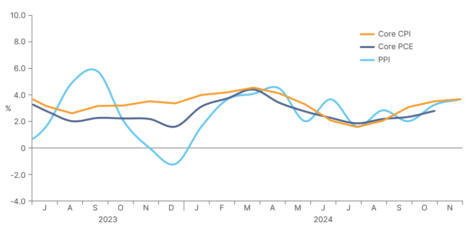
Fig 1: US CPI 3-month moving average

Source: Ashmore, Bloomberg. Data as at 16 December 2024.