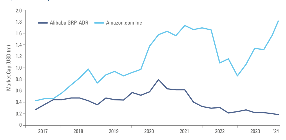
Fig 4: Market Cap (USD Trn)

Source: Bloomberg, Ashmore. Data as at 31 December 2024.