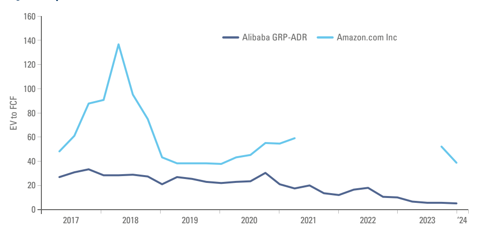
Fig 3: Enterprise Value (EV) to FCF

Source: Bloomberg, Ashmore. Data as at 31 December 2024.