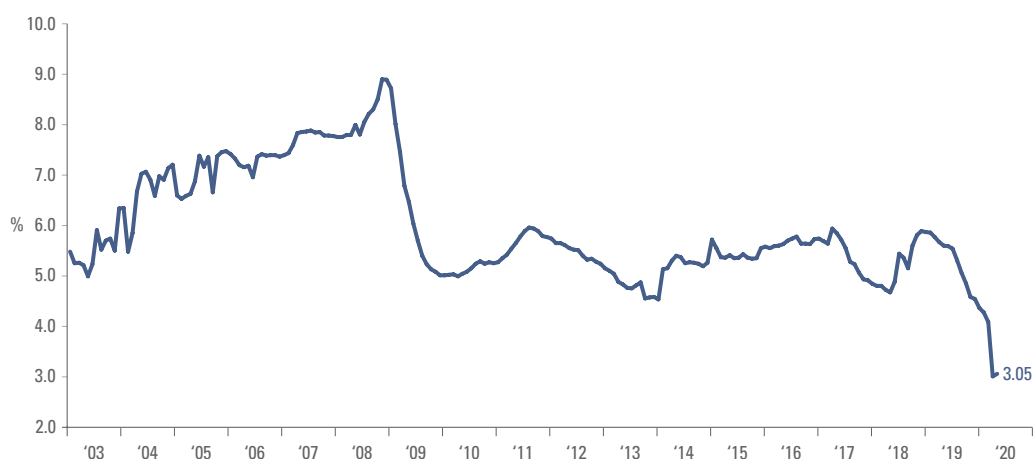
Fig 2: EM index-weighted policy interest rates

Data as at April-2020.