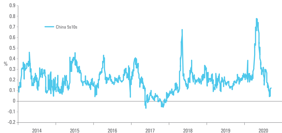
Fig 4: China government yield curve shape: 5s10s

Foreign investors should aim to enter over-weight duration positions in China, in our view. The CGB curve is currently very flat as yields at the short end have increased sharply in recent months in response to China’s strong recovery from the coronavirus crisis, thus pushing CGB 5s10s towards the low end of the range (Figure 4). Bull steepening of the curve and associated roll-down of longer-dated bonds seems a reasonable expectation going forward as the initial burst of economic activity from the lifting of lockdowns gradually dissipates.