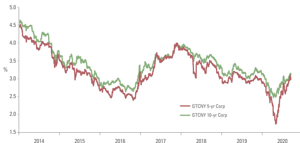
Fig 2: 5-year and 10-year nominal government bond yields

Locals are now finding themselves with too much fixed income on their hands and too little equity