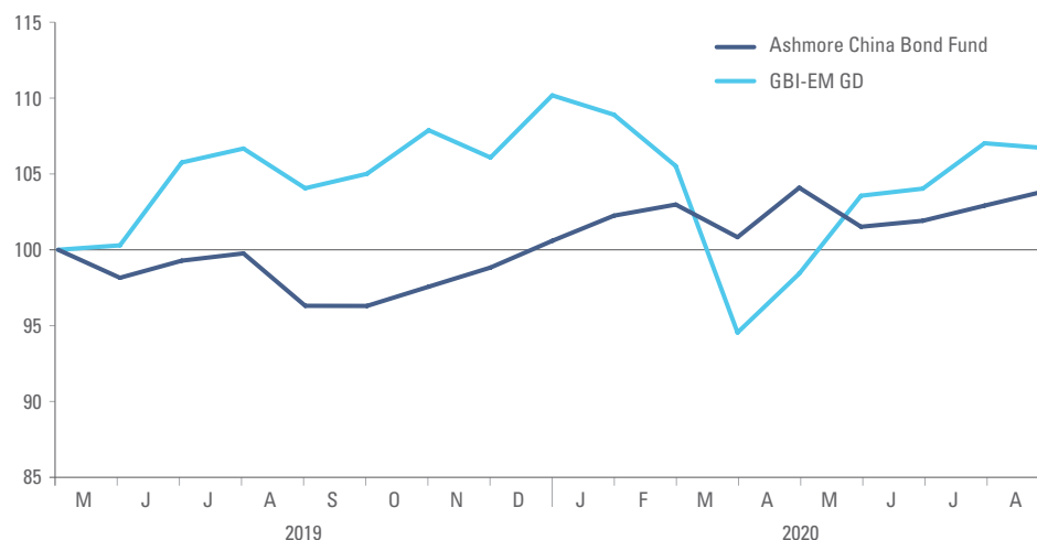
Fig 1: Chinese bonds and EM local currency bonds (index April 2019=100)

Chinese bonds make up 13% of the global fixed income, 52% of EM fixed income, and 74% of Asian fixed income