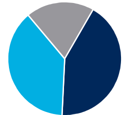
■ Government Bonds ■ Equities ■ Cash/MM