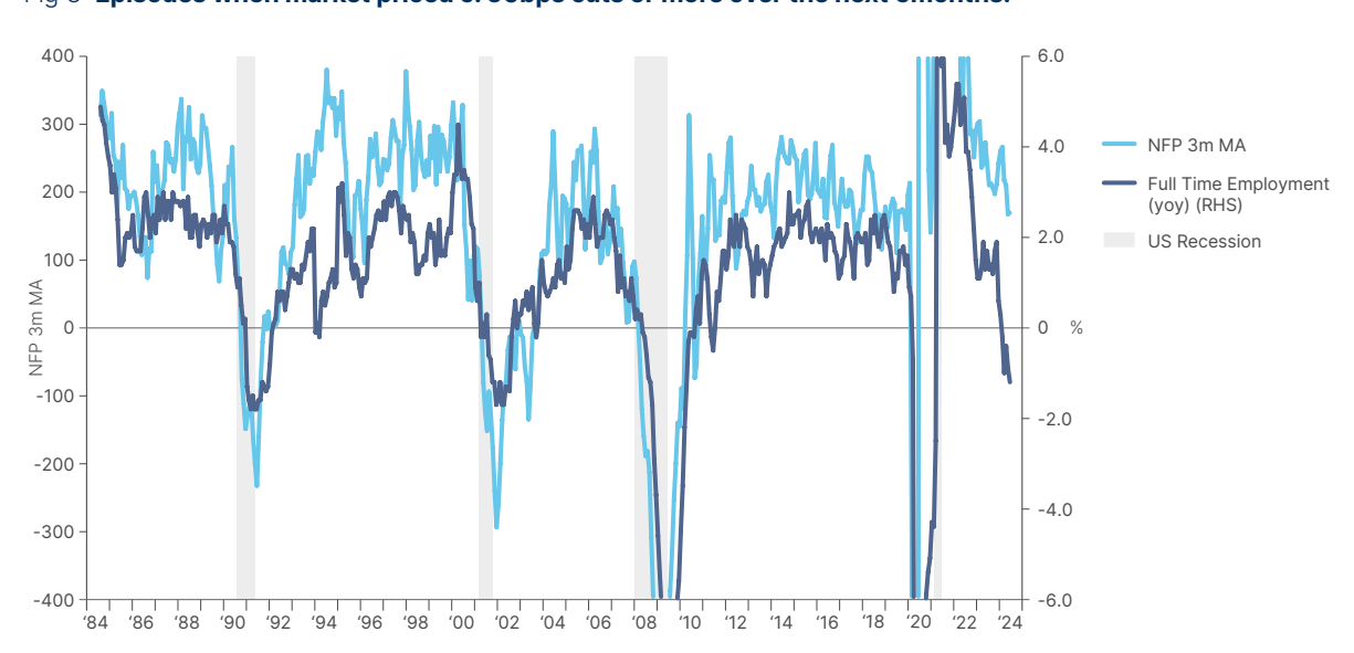
Fig 3: Episodes when market priced c. 50bps cuts or more over the next 6months.

The main fundamental factor driving today's panic was the US labour market, which cooled more than expected in July, adding 114k jobs as unemployment rose. Fig 3 shows that not only is job creation declining fast, but full employment has been at negative levels in yoy terms since February. The unemployment rate already rose by more than 0.5% against its 12-month moving average in Canada, New Zealand, Sweden, Norway, the UK, South Africa, and now the US. It is also near it in Hungary and Australia. Economist Claudia Sahm noticed that when the unemployment rate rises above this threshold, self-fulfilling dynamics take place, which explains why the US economy has hit recession every time this threshold was crossed since 1950. Sahm recently downplayed the importance of her own rule in a blog post-pandemic.¹ Nevertheless, while the supply of labour has increased, the overall data (including the Job Openings and Labor Turnover Survey (JOLTS) and claims suggests the demand for labour is indeed weakening at an increased pace.