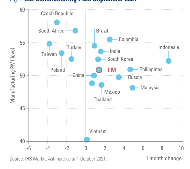
Fig 1: EM Manufacturing PMI: September 2021

Manufacturing PMIs: Global manufacturing PMI survey was stable at 54.1 as EM manufacturing PMIs improved 1.2 to 50.8 while DM manufacturing PMI deteriorated 1.2 to 57.1. Figure 1 shows twelve out of seventeen EM countries saw an expansion in their manufacturing PMI with the PMI of five countries rising more than 2.0 points: Indonesia (+8.5 to 52.2), Malaysia (+4.7 to 48.1), Philippines (+4.5 to 50.9), Russia (+3.3 to 49.8) and Colombia (+2.3 to 55.5). Nine countries had their manufacturing index above 52 in September. Only five countries saw a drop on the manufacturing PMI with Taiwan (-3.8 to 54.7), Czech Republic (-3.0 to 58.0) and Poland (-2.6 to 53.4) declining more than 2.0, but remaining in expansionary territory above 50. Only four countries had their manufacturing PMI below 50, a line that for EM countries suggests lower than potential GDP (not contraction). The only country with the PMI below 48 is Vietnam (40).1