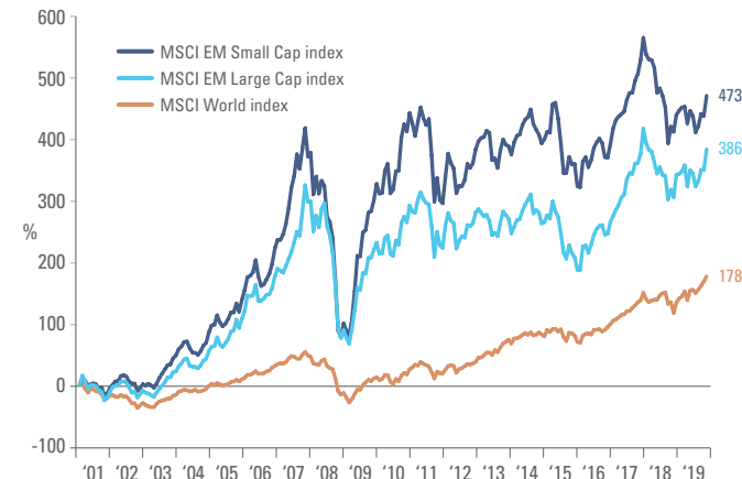
Fig 3: Strong stock market returns and lower volatility

Investors are best placed to take advantage of periods of lagged performance and attractive valuations to build exposure