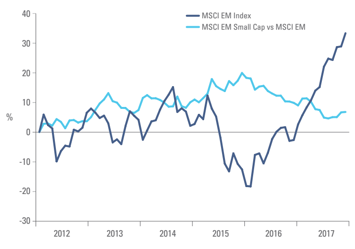
Fig 2: Emerging Markets Small Cap performance

As sentiment has improved towards Emerging Markets in general, we would expect investor attention to increasingly turn to less covered areas of the market including smaller companies. Investors are likely to be attracted by smaller companies' significant exposure to domestic consumption driven themes, not least given the anticipated development of strong domestic growth cycles. More export orientated companies will benefit from the anticipated ongoing positive global backdrop. The gradual pace of developed world monetary policy normalisation should not prevent still ample global liquidity supporting perceived risk assets.