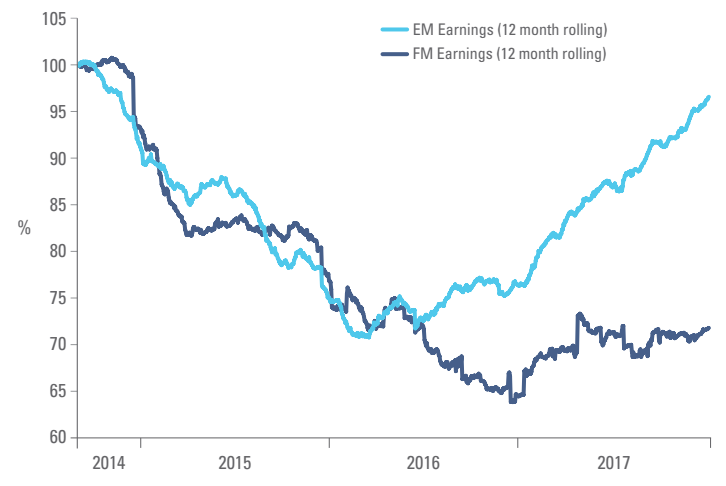
Fig 3: The recovery in Frontier Markets earnings

In 2017 Frontier Markets returned 31.8%, lagging the Emerging Markets rally. Similar to Emerging Markets, improvements in earnings growth and earnings expectations have driven returns. However, significantly, the earnings recovery is only just starting in Frontier Markets. Moreover, frontier valuations are reasonably attractive trading in line with emerging and at a discount to developed markets. The MSCI Frontier Markets index is trading around 12x price-to-earnings ratio.