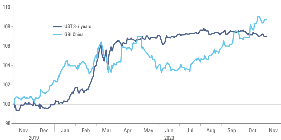
Fig 2: UST vs Chinese government bonds (5-year maturity)

Data as at 2 November 2020.