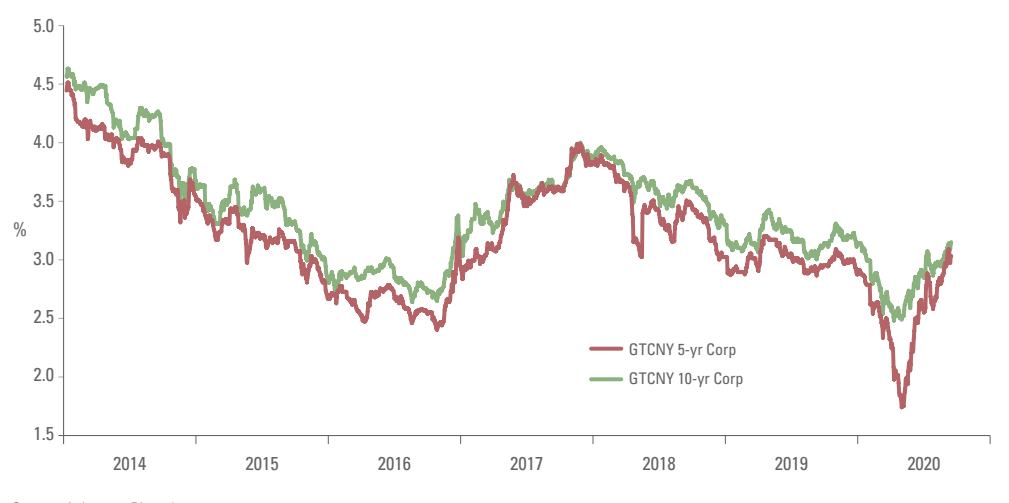
Fig 2: 5-year and 10-year nominal government bond yields

This is happening against the backdrop of a stronger than expected recovery in Chinese growth. Both reduce the likelihood of significant additional monetary easing. To make matters worse, Chinese stocks are doing very well. Locals are therefore now finding themselves with too much fixed income on their hands and too little equity. The excess exposure to bonds is leading to selling, which in turn pushes up bond yields. This may continue for a few months, in our view.