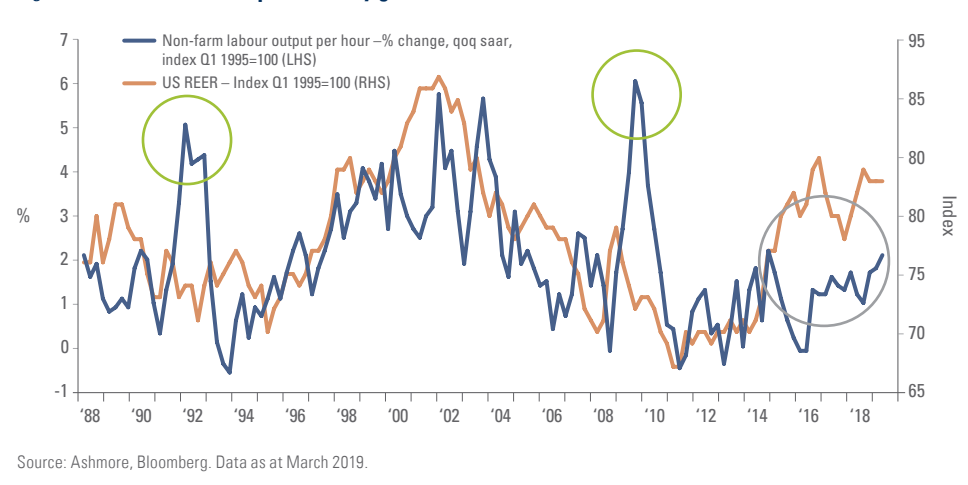
Fig 5: US Dollar (real) and productivity growth

Low US productivity rates to drive the USD down