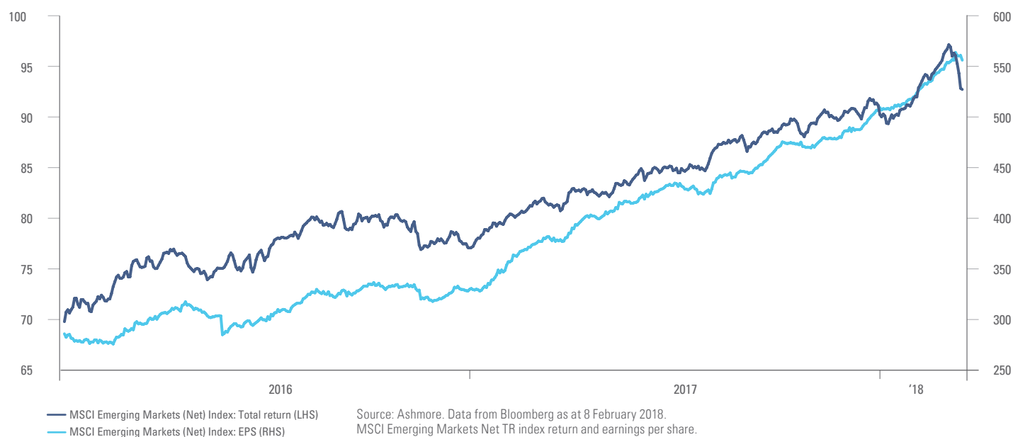
Fig 1: Emerging Markets performance and earnings

Emerging Markets equity investors have once again over reacted to Developed Market events. Since 26 January the MSCI Emerging Markets index has fallen 8.6%. Over the same period, developed markets based on the MSCI World index have fallen 9.0%. This is the sharpest correction since the Emerging Markets cycle low in early 2016 and has prompted investor concerns over the outlook for markets. We believe the recent pull back presents another attractive entry point for investing in emerging markets equity. Fundamentals, valuations and market factors all continue to point to a bright outlook.