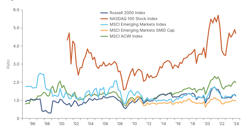
Fig 5: Price to Sales Ratio - Selected Indices

Data as at 1 May 2024.