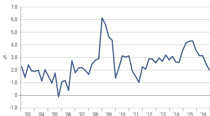
Fig 2: US-EM inflation differentials based on headline CPI