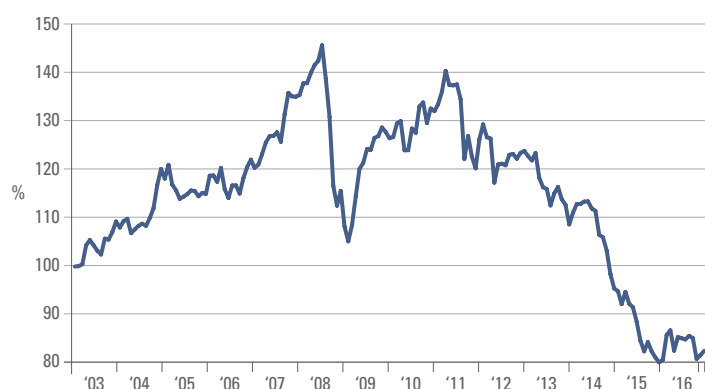
Fig 1: EM nominal exchange rates

Inflation differentials are an important consideration in evaluating return prospects in EM local markets. Between April 2011 and January 2017 EM currencies declined from 140.4 to 82.2 or 41.4% – see chart below.