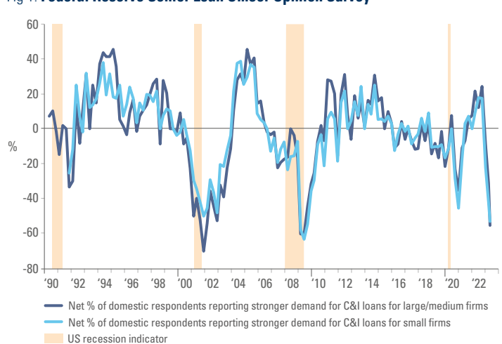
Fig 1: Federal Reserve Senior Loan Officer Opinion Survey

Source: Federal Reserve, Bloomberg, Ashmore. Data as at 8 May 2023.