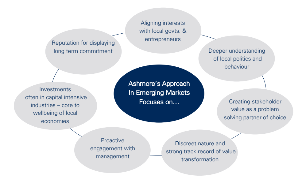
Building long-term constructive relationships that strengthen reputation, build brand and lead to further deal flow

growth, enabling access to these markets by both developed world pools of capital and also, increasingly, by Emerging Markets pools of capital.